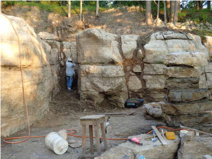
Previous pages: Waterfalls dropping over carefully exposed rock. Above: Mary cleaning out a crevice created by a glacier.

At the steeply sloped top of our property, streams have eroded 75 foot (23 m) deep ravines in the second-growth forest. There are traces of old logging roads and the remains of barbed wire deeply embedded in the trees. We've recently cut dirt roads and woodland paths through this difficult-to-access area and built an overlook over the north ravine. Downhill is an abandoned red pine plantation which is our best area for growing rhododendrons and mountain laurels. Further downhill, the north creek flows past a bamboo grove that we're trying to get under control and then falls into the upper pond. The waterfall outlet of the pond feeds a series of waterfalls with a total drop of 18 feet (5.5 m).