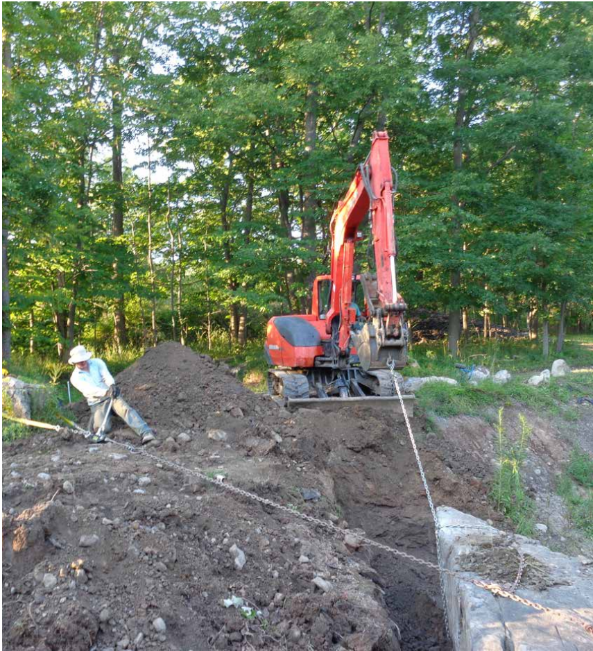
Bill helping the excavator slide a limestone block with his come-along

Most of the bedrock and stone that you see in the photo on the previous two pages was originally buried under 10 feet (3 m) of clay. The clay has been removed after 20 years of digging and used to build berms and hills that enhance the natural ravine and our hill and pond stroll garden