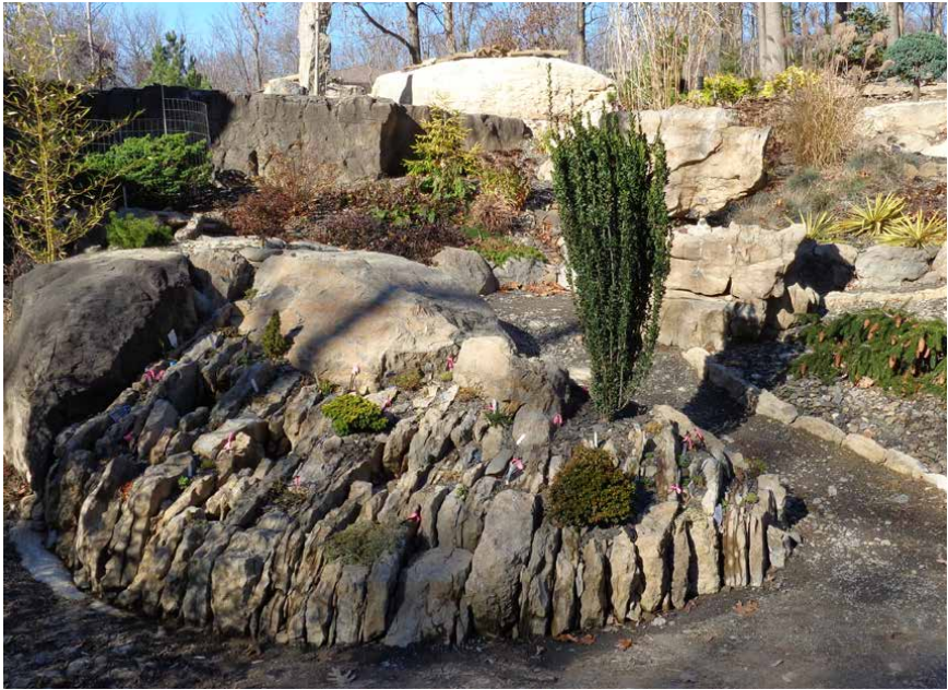
Ilex crenata 'Sky Pencil' planted at the edge of a crevice garden.

tons of limestone (so far). All the stone to the right of the small tufa wall in the photo was placed by us while rocks to the left were placed by the glacier. The soft horizontal seams on the left side have been eroded into wide cracks where we tried to grow plants for years. Frosts and rain would erode the soil and the plants would fall or dry out so we made planting pockets by mortaring one and a half-inch (3.8 cm) high stones to the bottom of the cracks to retain a small amount of soil. Roots can then grow many feet into the horizontal seam material. These high pockets are the one place where campanulas are safe from our woodchucks.