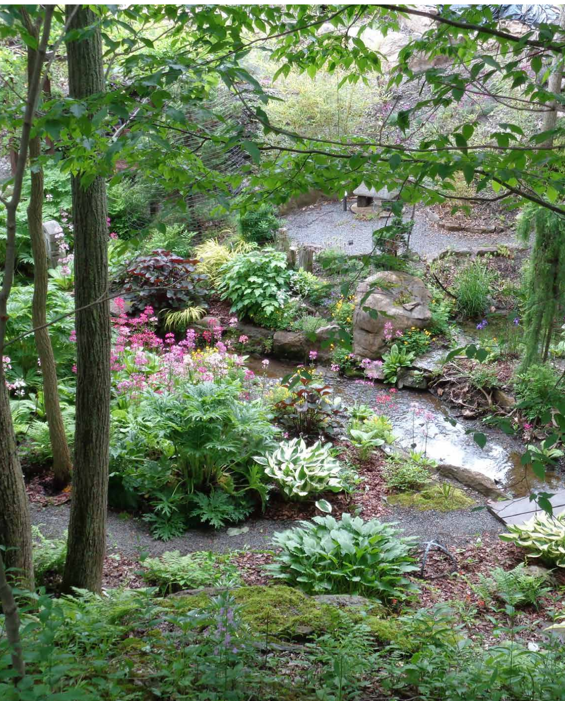
Moisture-loving plants thrive in the ravine garden.