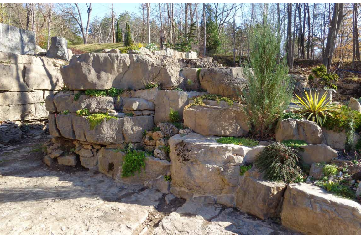
Entrance to The Canyon, which has been enlarged by careful rock placement.

The last glacier arranged nine-foot (2.7 m) high limestone blocks on the mid-level bedrock shelf to form a passageway that we call The Canyon. The entrance of the canyon is shown below. We're enhancing and lengthening The Canyon to 160 feet (49 m) by placing about 60