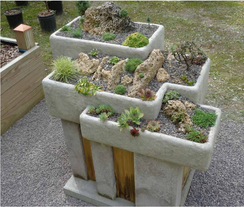
A lightweight, yet very strong, stucco trough,

The stucco trough in the photo above is two feet by three feet (0.6 x 0.9 m) and weighs 19 pounds (8.6 kg) when empty. It's lightweight because the walls are formed with insulation foam. It's strong because the walls are wrapped with fiberglass mesh and then coated with fiber-reinforced surface bonding cement. To save further weight, the interior of the trough is filled like a crevice garden with one-inch (2.54 cm) sections of a lightweight soil mix separated with two-inch (5 cm) thick vertical foam panels. Tufa in each of the three levels has been drilled for plants and for drip irrigation lines, with the emitters hidden in the base. We've been building and refining stucco troughs for 15 years and we've never had one break. We think it's time to share this knowledge, so I'll give a five-minute demo on building stucco troughs towards the end of the garden tour. Mary will give a one-minute demo of splitting a limestone boulder with feather wedges. We'll be under the pop-up tent.