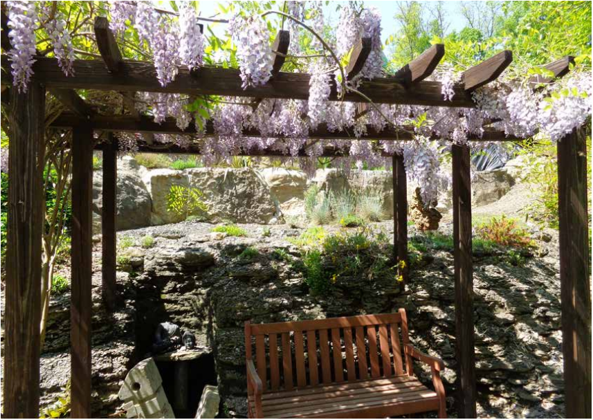
A seating area under a wisteria-covered arbor.

After cutting through five feet (1.5 m) of the soft shale, the creek enters the kitchen pond where we've planted a Laburnum x watereri 'Vossii' on its west bank. Golden chain trees are problematical in upstate New York, but we're hoping that our microclimate will protect it. Leaving the kitchen pond, the creek goes over another waterfall and enters the ravine garden.