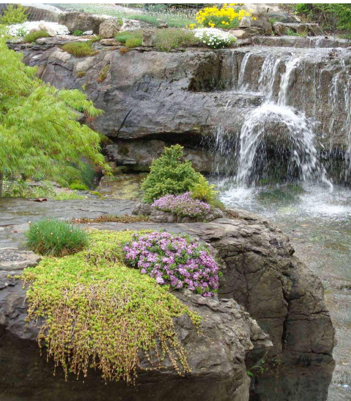
Plantings on top of Pride Rock, including a blooming Daphne x medfordensis 'Lawrence Crocker'