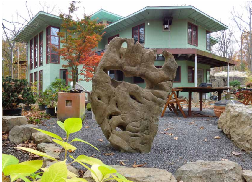
A water-eroded limestone slab.

Returning to following the water, the north creek then flows from the Tully limestone onto the Moscow shale. Artesian springs at the base of the limestone flow year-round at 48°F (8.8°C) so the subsequent waterfalls never freeze in the winter. The creek flows past Pride Rock, at 39,000 pounds (17690 kg), one of the largest rocks that we’ve moved. The tip of Pride Rock is splattered with tar that melted off the roof of a cottage that burned down in the 1950s. We’re building our new house over the old foundation. A crack in Pride Rock is planted with Daphne x medfordensis ‘Lawrence Crocker’, one of the first of many daphnes planted throughout the garden.